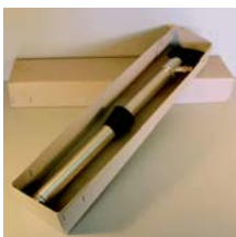
HAP21C pump without accessories