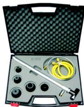
HAP21_C-set case with pump +accessories